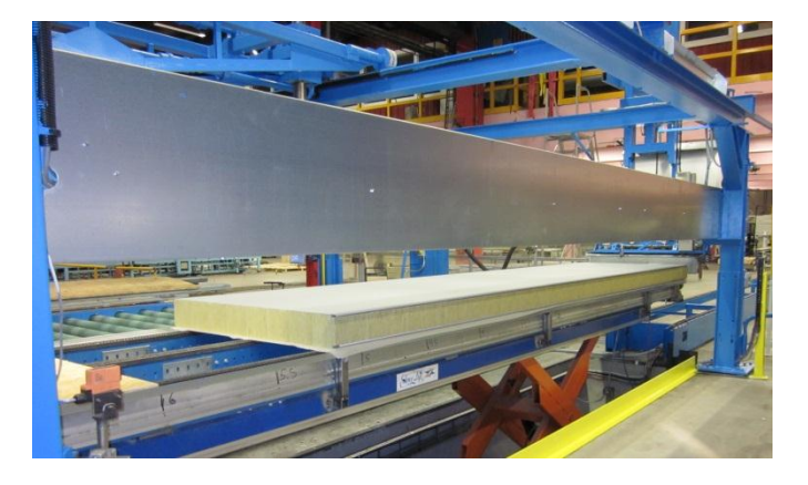
Lindab's first own produced sandwich panel